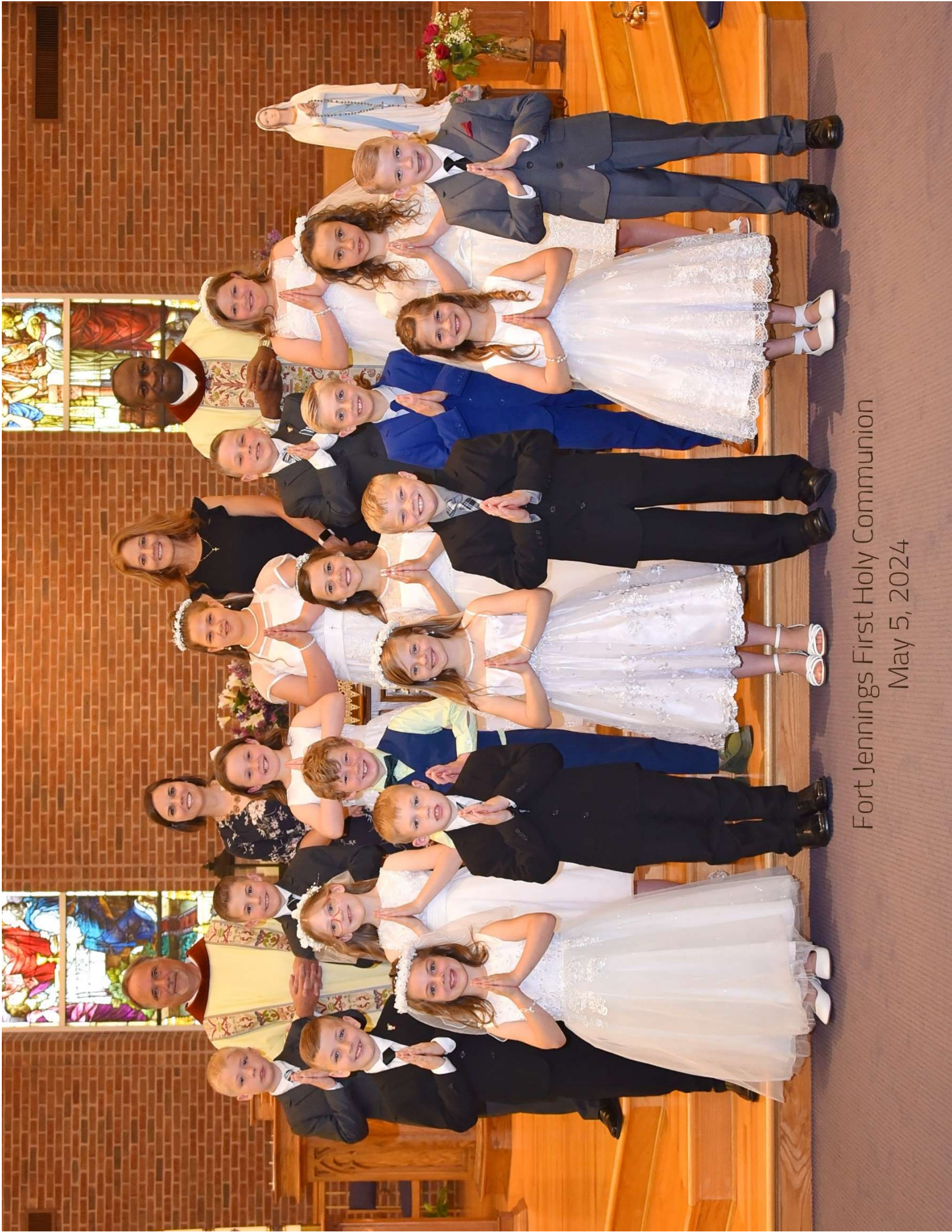
Fort Jennings First Holy Communion May 5, 2024